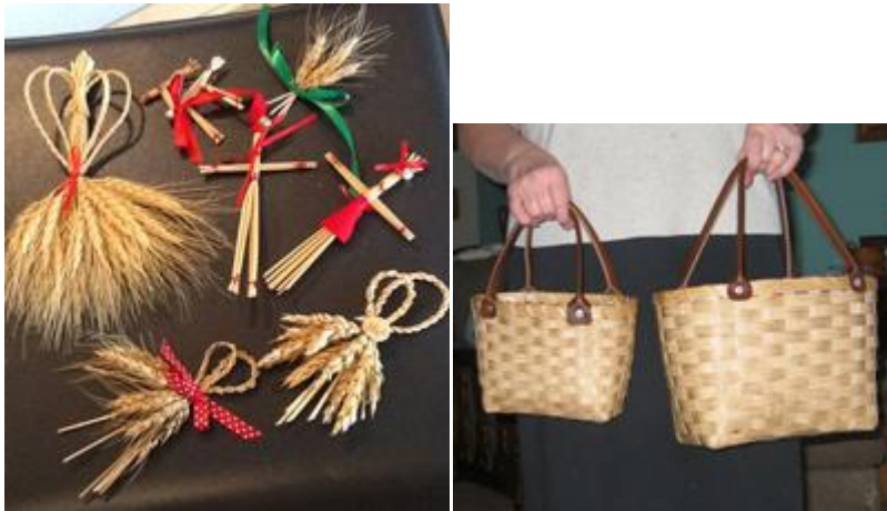
November 22 nd classes-Wheat Woven Holiday Ornaments and Basket Purse

Save the date for the Headwaters Basketmaker's Guild 2015 workshop-April 17, 18 and 19 2015 at Concordia Language Villages near Bemidji, MN. Teachers will be announced soon.