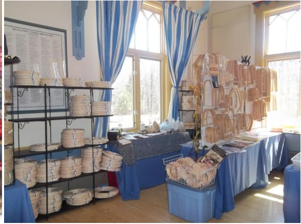
The store-Atkinson's Country House.