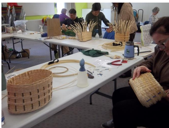
Speaking of pictures.....