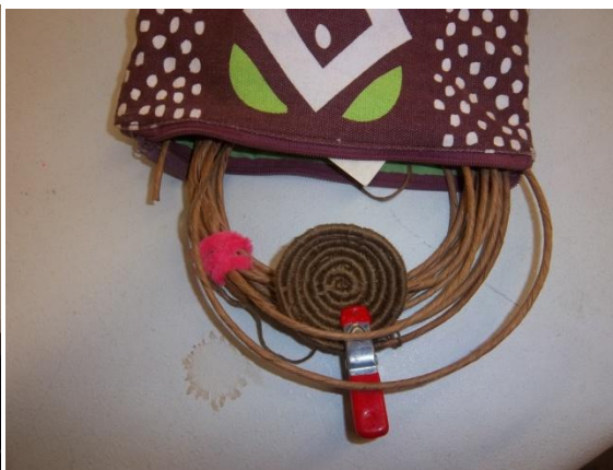
Shirley Mount and Della Pleski. Louanne Hipp's coiling project with Tressa.