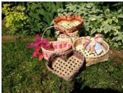
Plaited Heart Shaped Basket Louanne Hipp $30