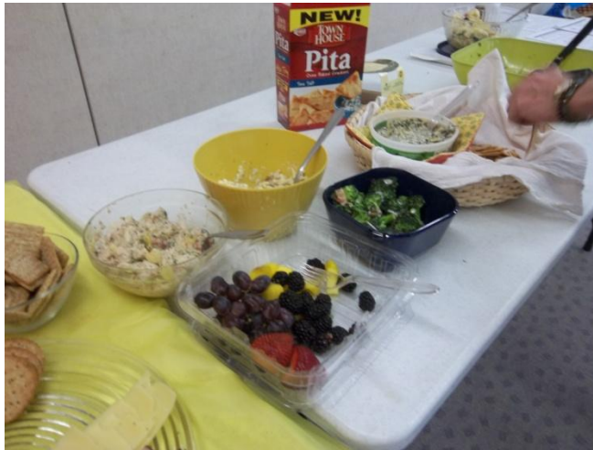
Everybody brought healthier foods, not a bar or cookie in sight. All salads and veggies!!!

Answer to what do they have in common-they all use baskets one way or another, but you knew that already.