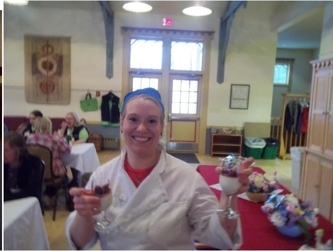
The excellent cook, explaining dessert.