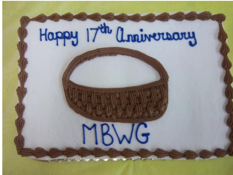
Our cake-and it was good!!!