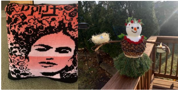
Frida Kahlo pillow