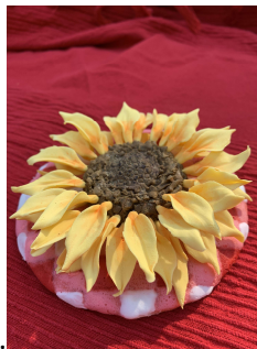
Here's the finished product!