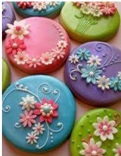
These kind of inspired me...

This month I had my own Covid scare. I had to quarantine for about a week and a half, then the test came back negative – such a relief! Had to cancel my hiking trip up north, so I am participating in the virtual cookie decorating competition offered by the Minnesota State Fair – that was the only competition they had! - hope to see you soon!