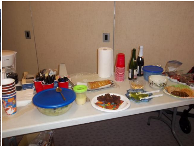
And it wouldn't be a potluck without food, this year we ordered pizza from Pizza Luce.