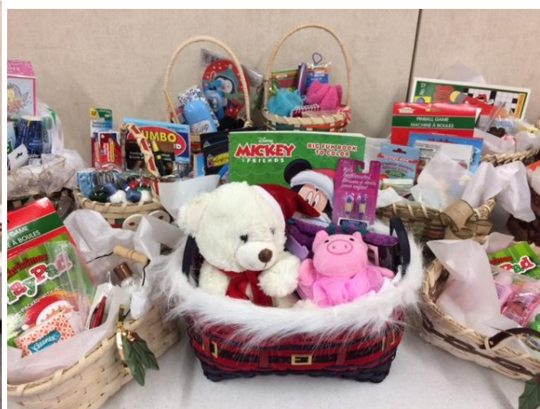
Total 18 baskets for Alexandra House, a women's shelter. Yeah!!!