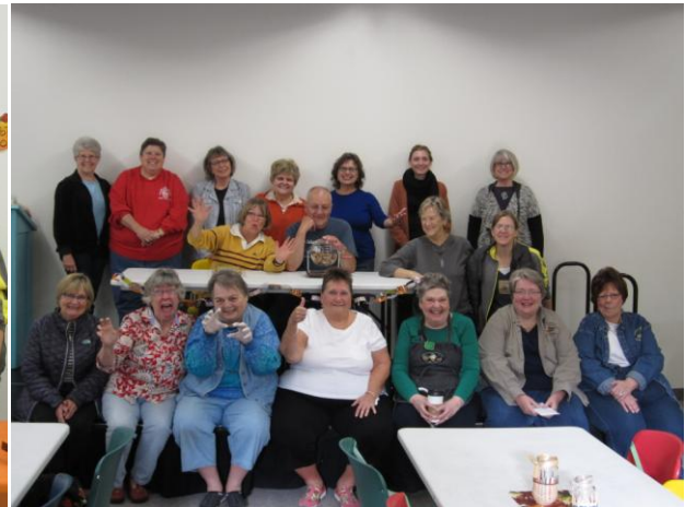
Set up Crew