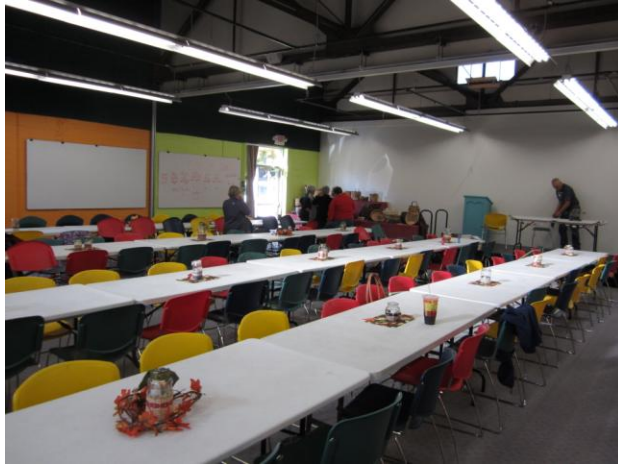
Before the eager Bingo players arrive.