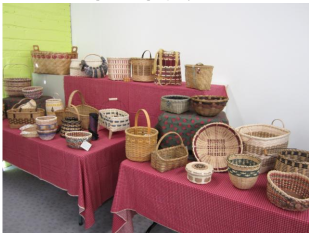
Large Basket Prizes