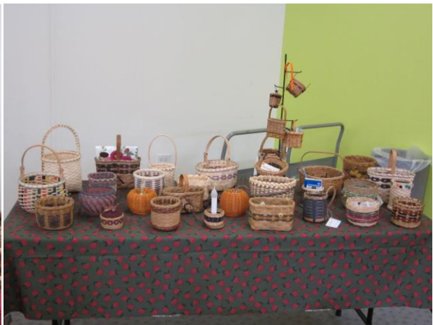
Small Basket Prizes