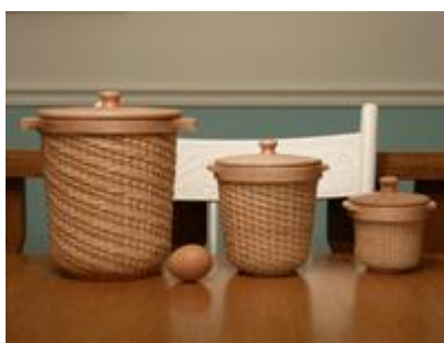
Nesting Nantuckets Shirley Mount S $40, M $45, L $50