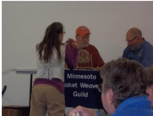
The prez discussing the game with the callers.