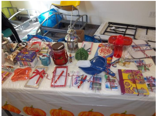
Raffle prizes galore!