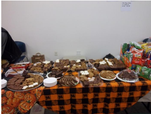
Look at all the goodies!