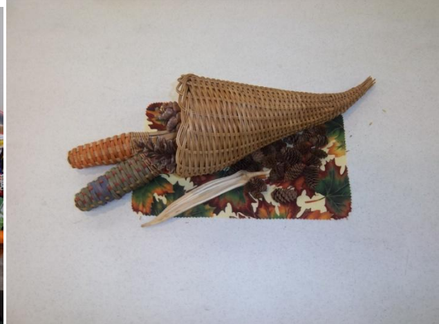
And our table decorations too!