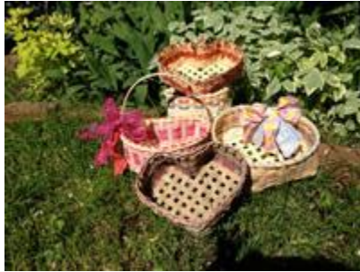
Plaited Heart Shaped Basket Louanne Hipp $30