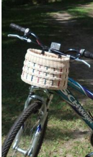
Paul Bunyan Trail Bike Basket $46 Jo Guttormson