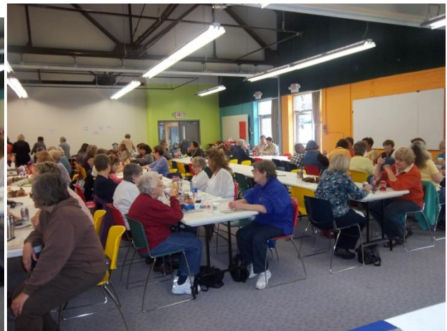
What a great looking crowd that day. An awesome time was had by all.