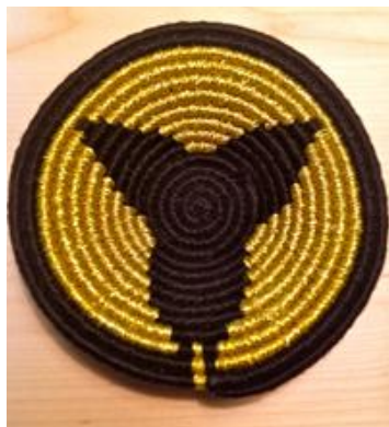
Trillium Coiled Basket Tressa Sularz $45