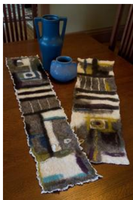
Felted Table Runner Leslie Granbeck $70