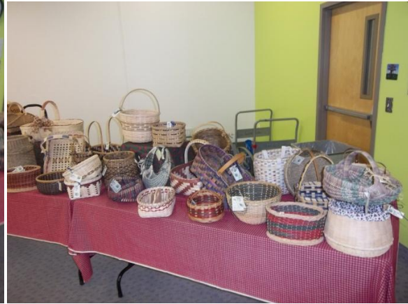
Look at all the baskets! These baskets are for the big bingo win.