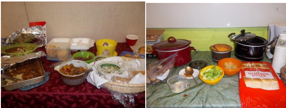
Lots of goodies were on hand for the potluck as well as nutritious treats.