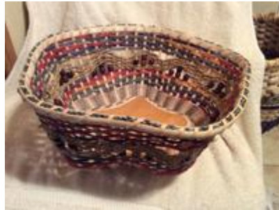
Wavy Star Basket $40 Julie Pleski