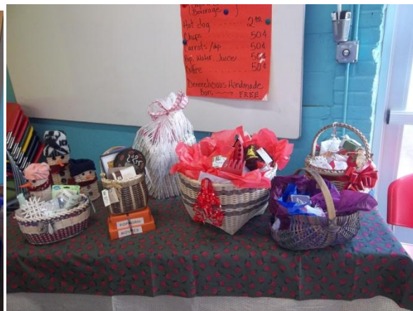
The baskets and bowls were for the bucket raffle. And these large filled baskets were for the big raffle prizes (along with our food price list)