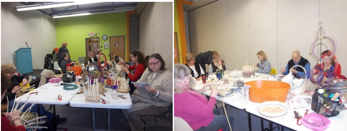
Everybody is concentrating on their basket for the service project-baskets for the Alexander House, a shelter for women.