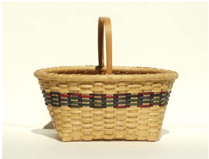
Bob Coyle - Winnebago - $38

A great size market basket. Learn Bob's methods of refined finishing techniques to take your basket to the next level of basket weaving. Use space dyed reed for the color band. This basket is topped with a hand carved oak square handle.