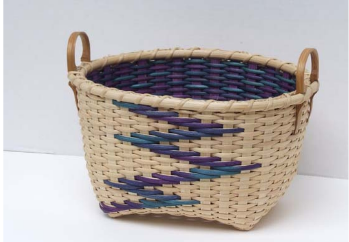
Susan Coyle - Oval Double Wall Sock - $48

Learn double wall construction and cathead shaping in this very sturdy basket with hand carved oak bushel basket handles. The compensation on the outside wall will make the design for the overlay embellishment. Basket is woven in space dyed and natural reed. A very useful basket from the home to the garden.